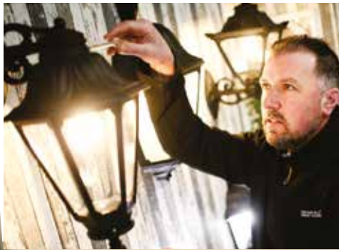
> POS Electrical