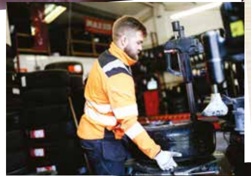
> Fast Tyre